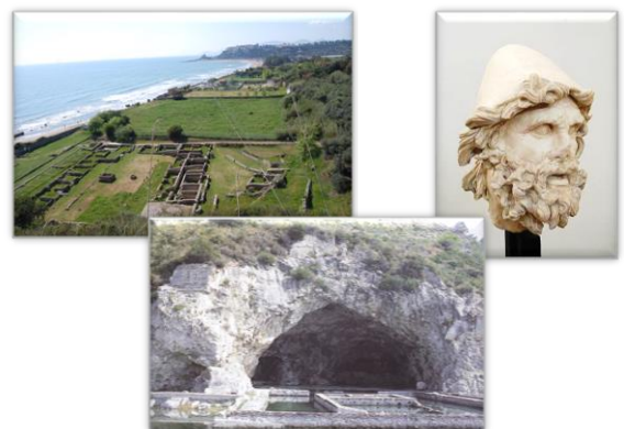
Integrated solutions for a sustainable fruition of Ulysses Riviera