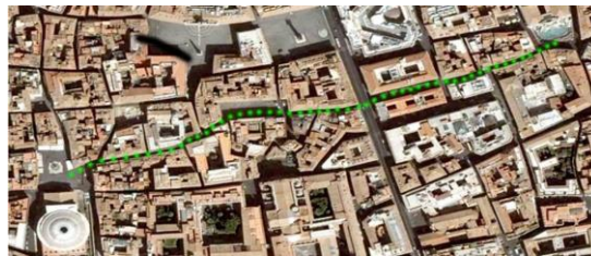
Pantheon – Trevi Itinerary